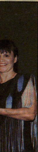
es the Presi- University

t comes to our It strikes me do care about am. Each and t commitment walks through pecial and deca- tion, the best e best life can the difference nt be success- d challenges."